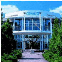
QinetiQ's Farnborough headquarters